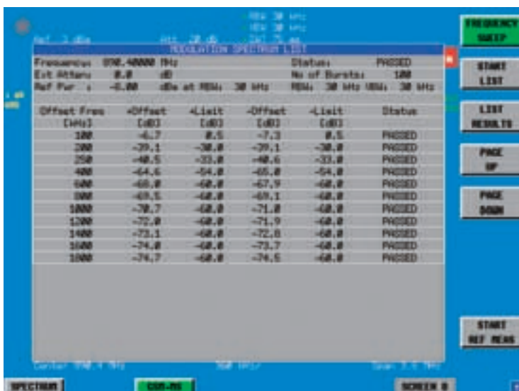
FIG 4 Display of results measured for spectrum due to modulation